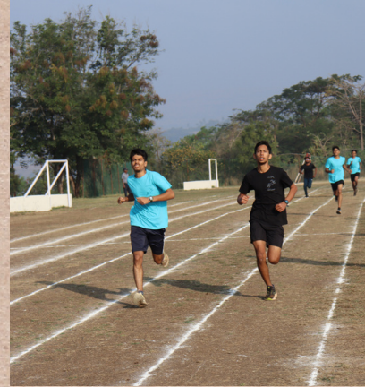
Sports Fest 2023