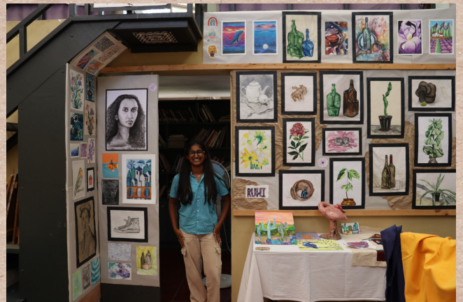
Display of work done by Art students of Grades 10 and 12