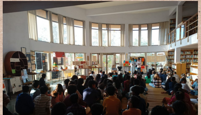
Assembly by Class 6 in the library