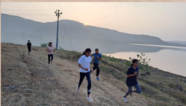
Picture from Cross Country Run which was conducted at the start of the year, on 7th January.