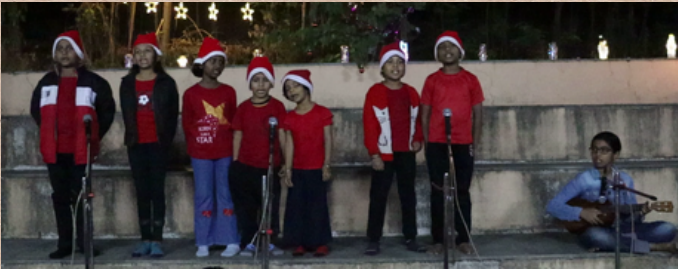
Christmas Carol by the Pre-School students