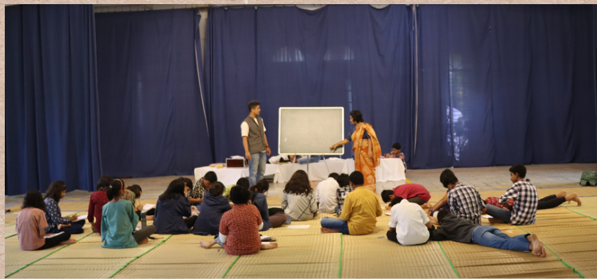
Storytelling workshop with Grade 7