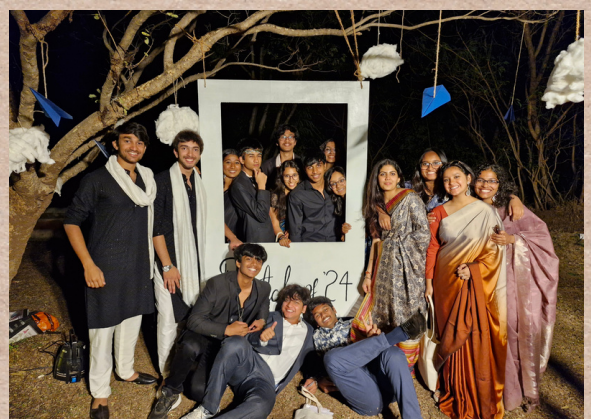
Classes 10 (left) and 12 (right) on the occasion of farewell