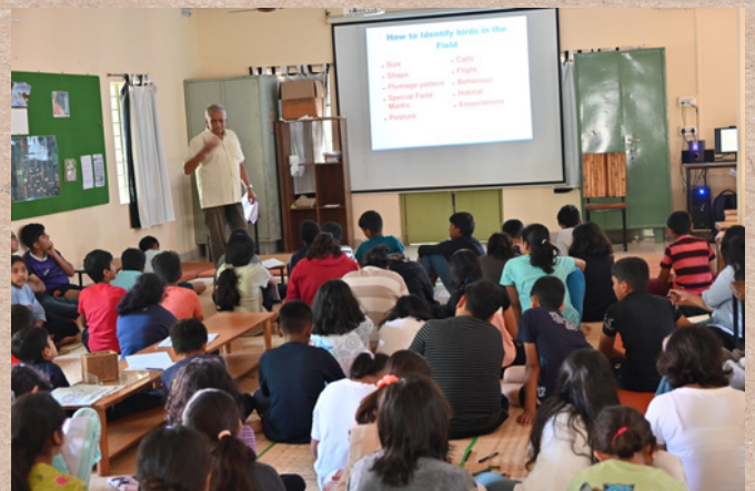
Field Notes taken during the workshop